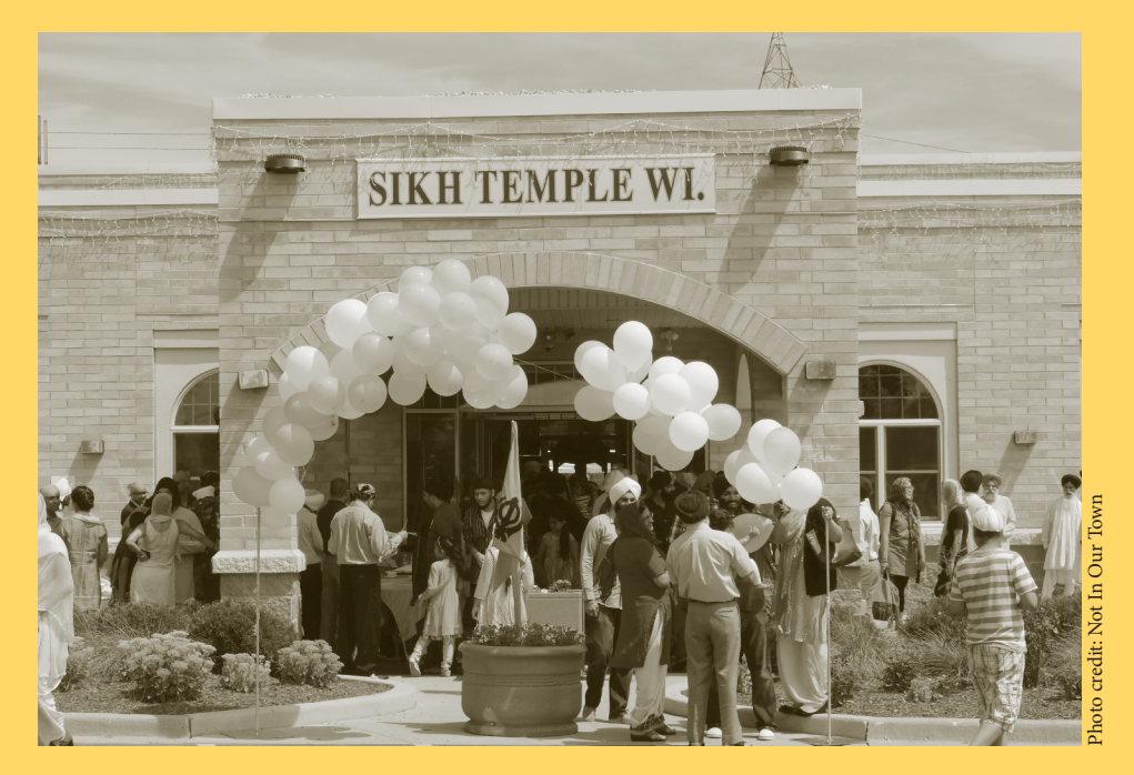
The Sikh Temple of Wisconsin in Oak Creek