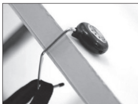
Example of a portable bag clip that attaches to a table.