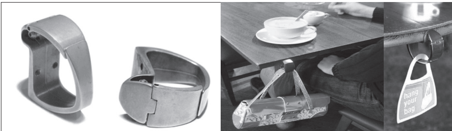
Examples of alternative table clips.