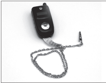
Example of a lanyard.

Other examples include personal table clips that customers can carry with them for use at any location, and solutions that aim to camouflage or conceal valuable items such as laptops. Although police agencies are unlikely to distribute or endorse these products, educating the public about their existence may be helpful.