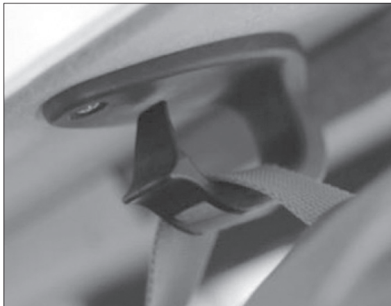
An example of a Chelsea clip which can be attached underneath tables to secure customers' bags.

Major coffee shop chains and fast food outlets have shown interest in design solutions such as bag clips and anti-theft furniture, but, at the time of writing, are not yet using them.