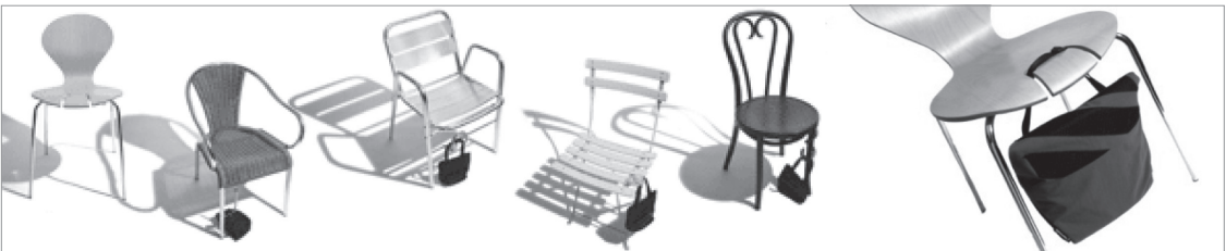
Examples of anti-theft furniture.