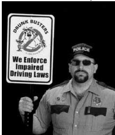
Drunk Busters of America

Although police want to create the impression that all drunk drivers will be arrested, in reality only a small percentage of drunk drivers on the road at any particular time will in fact be stopped or arrested.