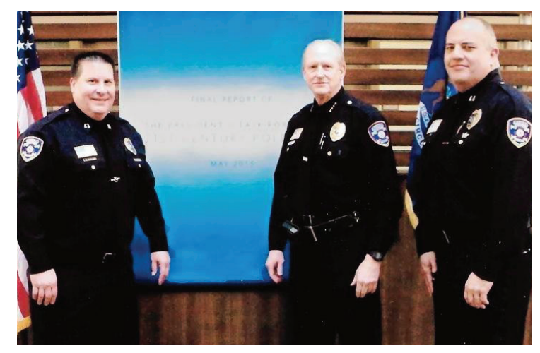
Dearborn Heights Command Officers attend the "Analysis of the Final Report of the President's Task Force on 21st Century Policing" workshop hosted by the Livonia (Michigan) Police Department on March 1, 2016.

Since the task force's final report was released in May 2015, it has quickly become a foundational document serving as an anchor for an ongoing national discussion on policing reform. Major law enforcement and civic organizations including the International Association of Chiefs of Police (IACP), National Organization of Black Law Enforcement Executives (NOBLE), Major Cities Chiefs Association (MCCA), Police Executive Research Forum (PERF), National Sheriffs'