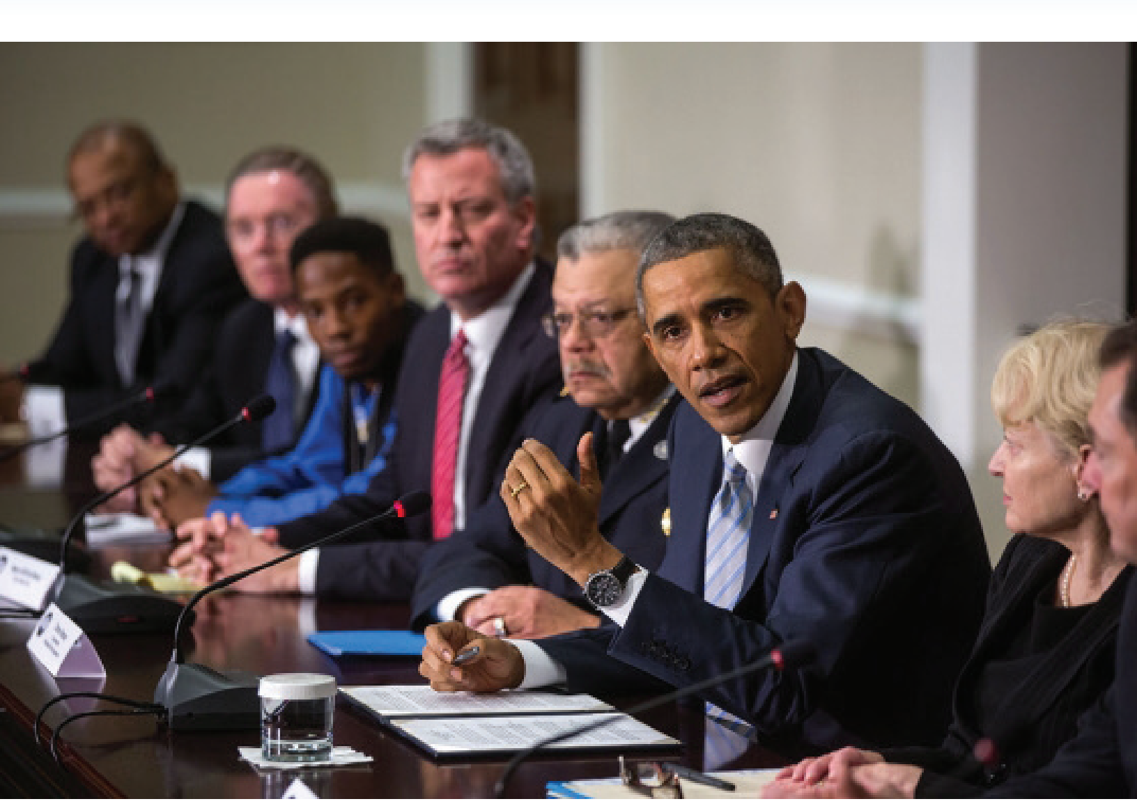
President Obama announces the creation of the Task Force on 21st Century Policing at a White House meeting on December 18, 2014.