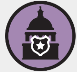
State Law Enforcement Agencies