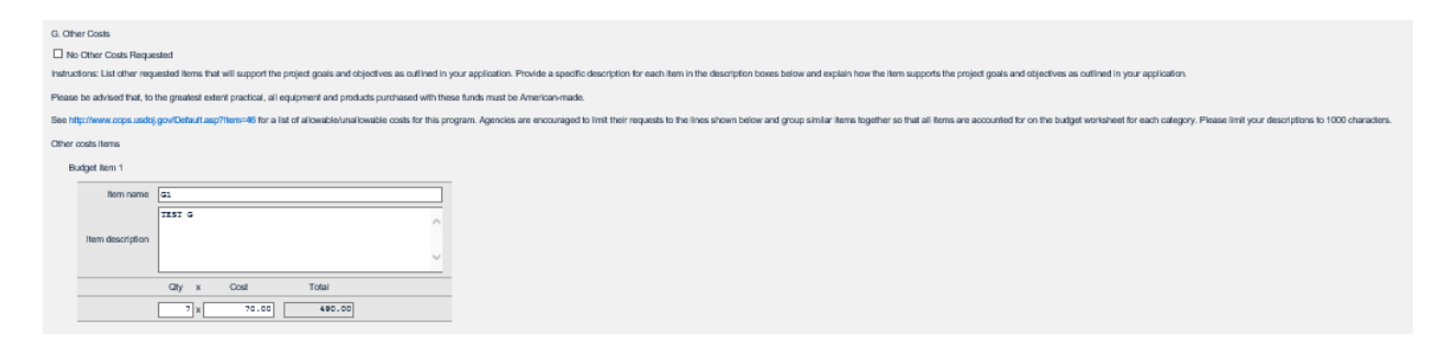
Figure 9. Sample budget detail worksheets: Other costs

Items not included in the above categories but which have a direct correlation to the overall success of a recipient's project objectives and are necessary for the project to reach full implementation will be considered on a case-by-case basis by the COPS Office. Please include all overtime costs in this section.