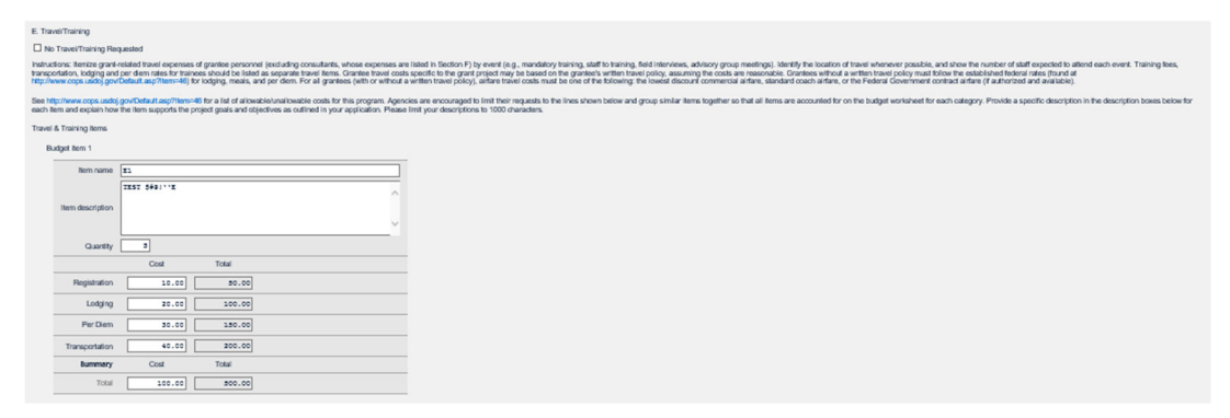
Figure 6. Sample budget detail worksheets: Travel and training

For information on the FTR and U.S. Government General Service Administration (GSA) per diem rates by geographic area, please visit www.gsa.gov/portal/content/104790.