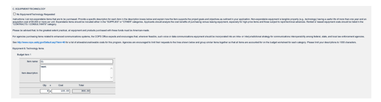
Figure 4. Sample budget detail worksheets: Equipment and technology

Necessary equipment must be specifically purchased to implement or enhance the proposed project. Equipment is tangible, nonexpendable personal property, including exempt property, having a useful life of more than one year and an acquisition cost of $5,000 or more per unit.