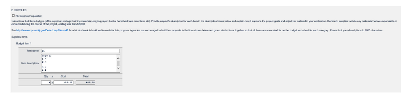
Figure 5. Sample budget detail worksheets: Supplies

Supply costs consist of those incurred for purchased goods and fabricated parts directly related to an award proposal. Supplies differ from equipment in that they are consumable, expendable, and of a relatively low unit cost, defined as less than $5,000 per unit. Such costs may include paper, printer ink, pens, pencils, laptops, etc.