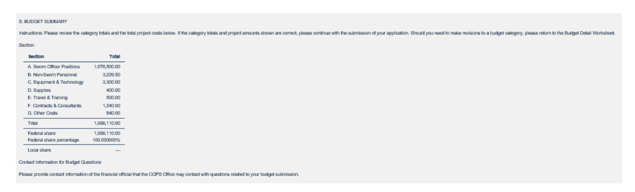
Figure 1. Sample budget detail worksheet: Budget summary and contact information for budget questions

If you need assistance in completing the budget detail worksheets, please call the COPS Office Response Center at 800-421-6770.