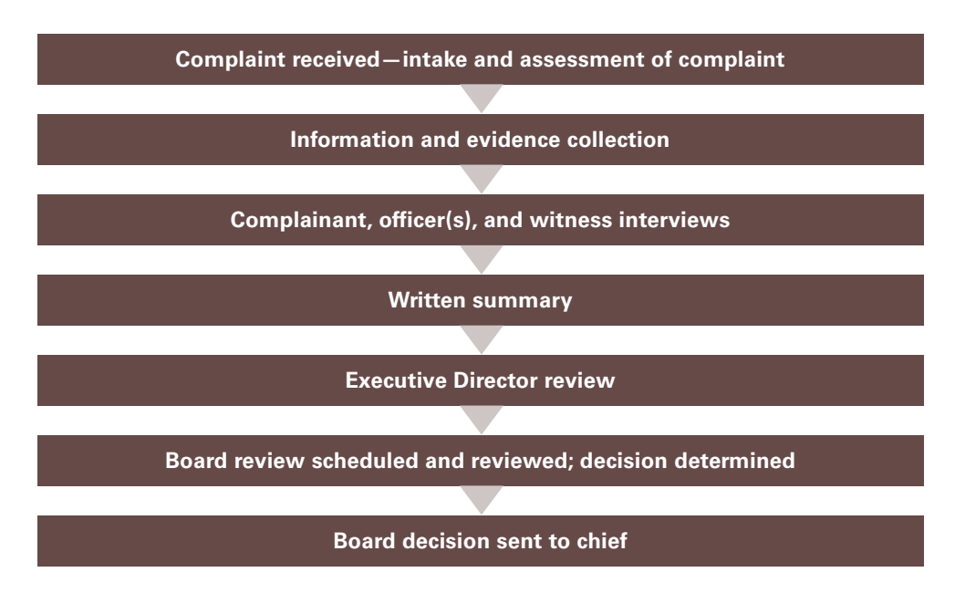
Figure 2. Summary of Atlanta Citizen Review Board Investigation and Adjudication Process