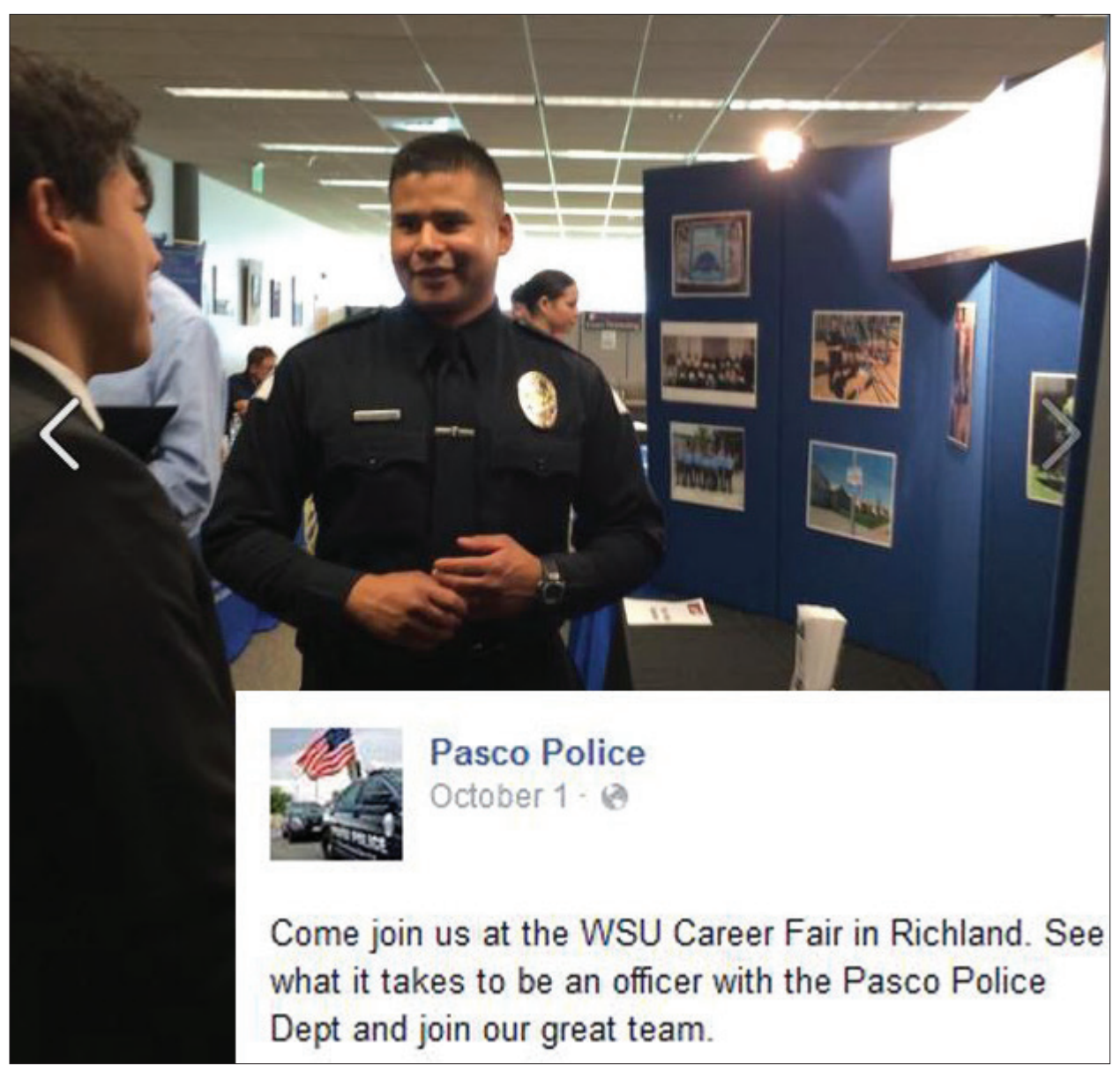
Photo posted to the PPD Facebook page of an officer speaking at a recruiting event in Richland, Washington

The PPD should develop and conduct formal training for personnel who will be using official department social media sites and initiatives. Conduct roll call trainings for employees on proper use of their personal social media pages.<sup>63</sup>