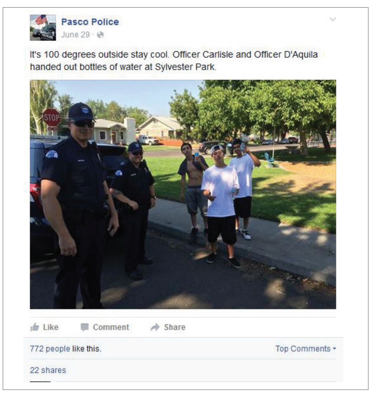
Photo highlighting a positive interaction between PPD officers and youth in the community posted to the PPD Facebook page