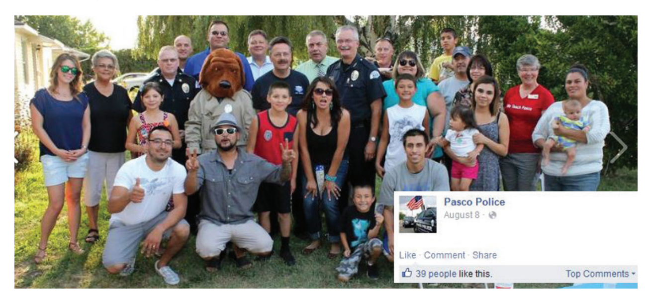
Photo posted to PPD Facebook page on National Night Out

Social media is one of the fastest ways to disseminate information. The PPD should continue to take advantage of this capability by quickly posting information about incidents or events that impact the community.