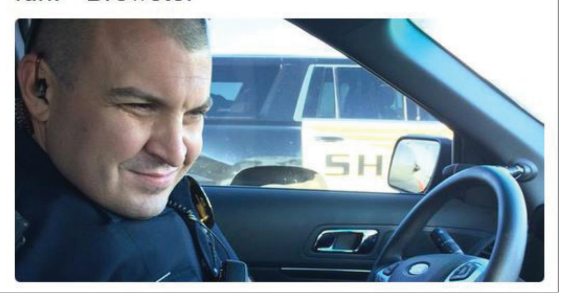
Tweet from the end of Officer Brewster's virtual ride-along