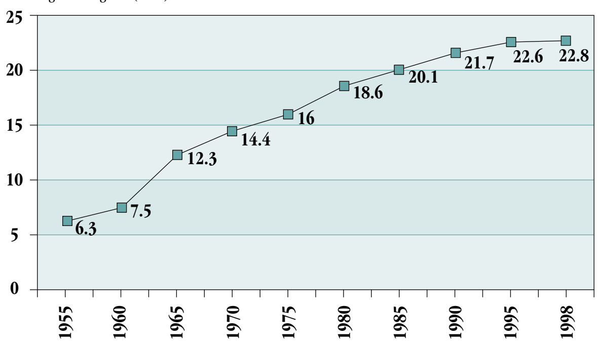
Exhibit 1. Median percentage of full-time civilian employees in large U.S. police agencies (1955–98), adapted from King and Maguire (2000). <sup>161</sup>

The first civilian employees were hired by police agencies as far back as the 1840s, around the inception of the first formal police agencies in the United States. In the early days of vocational policing, civilians composed a small proportion of the workforce, performing tasks such as cleaning and maintaining facilities, record-keeping, and serving as jail stewards. Since then, the number of civilians working in U.S. police agencies has increased gradually along with the size of the agencies. The average percentage of full-time civilian employees in large agencies rose from 4.1 percent in 1937 to 26.6 percent in 1999. Exhibit 1 illustrates the increase in the use of police civilians between 1955 and 1998.