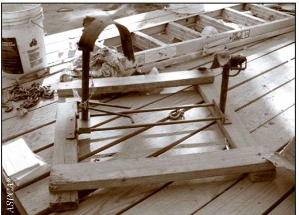
Above: a "Treadmill" and a "Rape Stand."

Barrels: Barrels or drums of plastic, or occasionally metal, are often used as shelter for fighting dogs. Placed horizontally, a hole is cut out from one side for the dog to enter and exit. Such housing might not meet state or local standards for required shelter if it does not provide adequate protection from the elements.