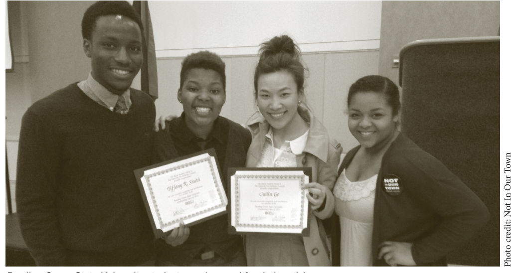
Bowling Green State University students are honored for their activism.