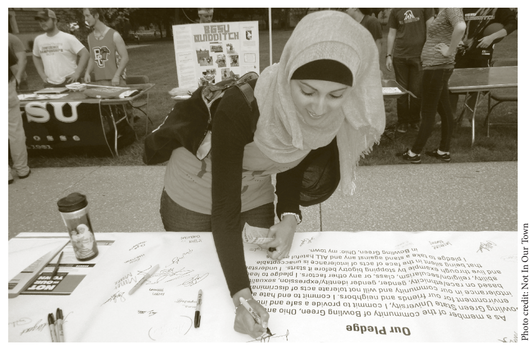
Bowling Green State University students sign the Pledge to Stop Hate.