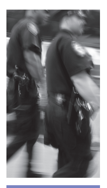
It is not just the number of officers that matter, it is what they do while on the job.

The PERF survey also reported that more than half of the chiefs would eliminate civilian staff before reducing officers. However, eliminating civilian positions does not necessarily eliminate a task that needs be done. When civilians are let go, sworn personnel may be brought in off the streets to fill those jobs, leading to a functional reduction in the force even if all sworn staff remain employed. And reductions in the number of officers available, whether through sworn lay-offs or by redeployment to previously civilian jobs, will ultimately mean that less manpower hours can be devoted to policing, therefore affecting the delivery of police services. For some agencies this has meant issuing policies that eliminate responding to certain types of incidents, such as burglar alarms, non-injury vehicle accidents, and motor vehicle thefts (PERF 2010). For many others, this has meant losing the time available for proactive problem solving and building the community relationships necessary to be effective.