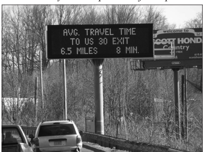
Providing drivers with more information about their commutes can help them to handle delays calmly.