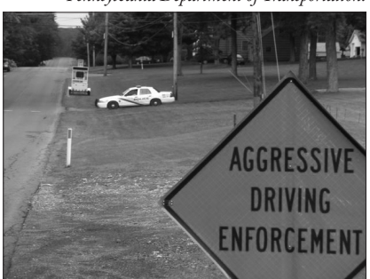
Pennsylvania Department of Transportation.

2. Conducting high-visibility enforcement. High-visibility enforcement has the effect of calming the driving behavior of a greater number of motorists than those police actually stop. Using marked vehicles can increase visibility, as well as adding magnetic "aggressive driving patrol" signs to enforcement vehicles.