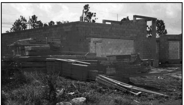
Example of large scale building materials being left unprotected during the early stages of a construction site.