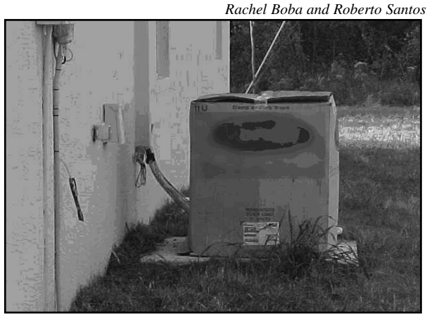
Example of an air conditioning unit delivered and left uninstalled.