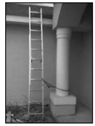
Example of target hardening of construction equipment.