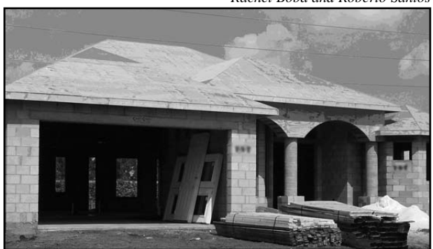
Example of a construction site with building materials and uninstalled doors left unprotected.