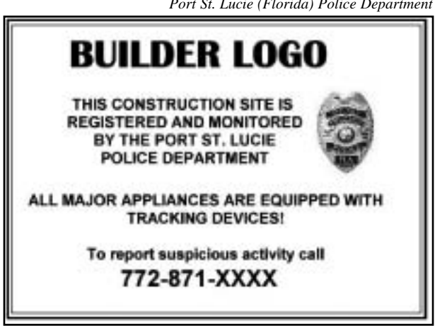
Port St. Lucie (Florida) Police Department

17. Displaying crime prevention signage. Prominently and strategically displayed signage can inform potential burglars that builders and police are working to reduce theft from construction sites. Well-designed, sturdy signs that can easily be modified and used at different sites can be a cost-effective prevention measure.44