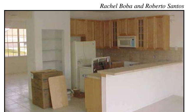
In this house under construction, the front door was left wide open with appliances left uninstalled in the kitchen.

that their employer does not care if tools are taken or may convince them that burglars are unlikely to be caught and prosecuted. <sup>10</sup> Finally, many builders treat burglary as an unavoidable cost of business <sup>11</sup> and seek to offset their losses by increasing house prices.