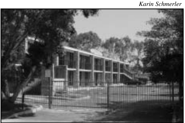
This motel fenced an unnecessary entrance/exit to reduce "pull-through" traffic.

18. Limiting access to the property. A key feature of a safe motel is its ability to control who has direct access to guest rooms and other parts of the property. Motels can limit access in a variety of ways, including the use of perimeter fencing, electronic gates, security guards, 35 and a property design that requires all foot and vehicle traffic to pass by the front office.<sup>36</sup> Some motels have converted exterior corridors to interior corridors to control access. At a notorious airport motel in Oakland, California. security guards function as a human barrier to those trying to access motel rooms. They send guests to the front desk to register, and ask potential visitors for the full name and room number of the person they want to visit. If visitors can provide this information as it appears on the room rosters the guards have, the guards send them to the front desk to register; if they cannot, the guards ask them to leave. Service calls have dropped by 59 percent since this practice, along with a series of other changes, was implemented.<sup>37</sup> A Charlotte, North Carolina, motel that erected a fence to eliminate non-motel foot traffic