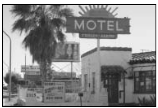
In an effort to attract customers, older motels such as this urban Arizona establishment offer rock-bottom prices for longer term guests, essentially creating lowincome housing.