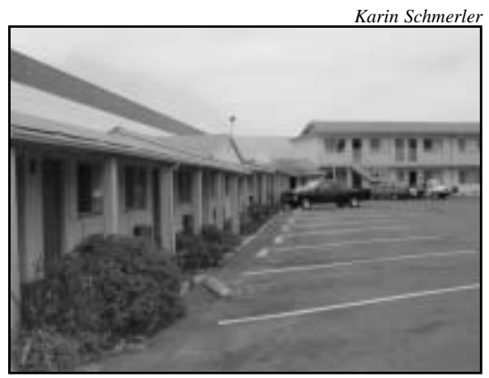
Drive-up motel rooms allow unrestricted and anonymous access to guest quarters at any hour of day or night.

Although there are notable exceptions, family-operated motels tend to have higher calls-for-service-per-room (CFS/room) ratios than chain motels. The CSUSB study found that family-operated motels' CFS/room ratios were 60 percent higher than those at non-family-operated motels. As of 2000, approximately 60 percent of hotels and motels were chain lodgings, and 40 percent were independently owned and operated. 11