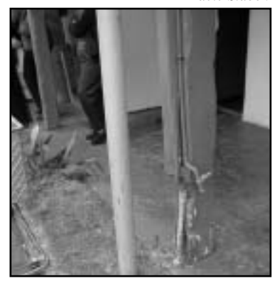
Because many independent motels were built more than 50 years ago and owners tend to limit investment in the properties, a number will exhibit moderate to severe code violations.

29. Implementing licensing requirements for lodging establishments, including minimum security, sanitation, and management standards. In Stockton, California, motels must meet minimum standards to obtain a permit to operate. Among other things, permit applicants must demonstrate that the property fully complies with all applicable building, fire, and health codes; that service calls to the property have not been "excessive," as determined by the police chief; that the premise is governed by a management plan that addresses cleaning schedules and property maintenance; and that the property manager has not been involved in criminal activity for at least five years† and has completed a motel-management training course co-taught by the police, fire,