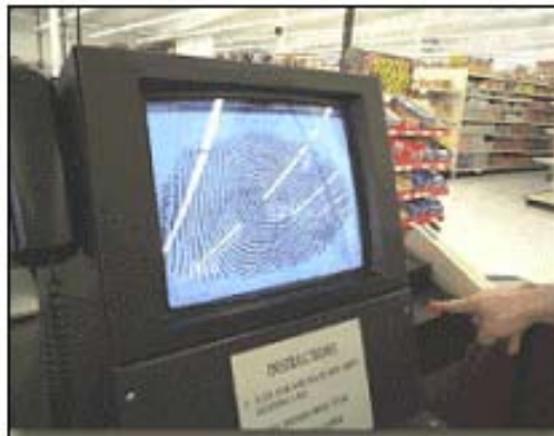
A sales clerk checks a customer's thumbprint.

Researchers have shown that adding simple security procedures can significantly reduce check and card fraud. In one U.S. study in a retail store, 32 a system that used picture IDs of customers who paid with credit cards reduced fraud by over 80 percent. Furthermore, retail stores (especially supermarkets) have found that customer databases that issue customers ID cards can also be used as an effective marketing tool to advertise special sales and promotions. A study in Norway 33 showed that legislation requiring people to show two forms of ID when cashing checks reduced check fraud by over 80 percent. †