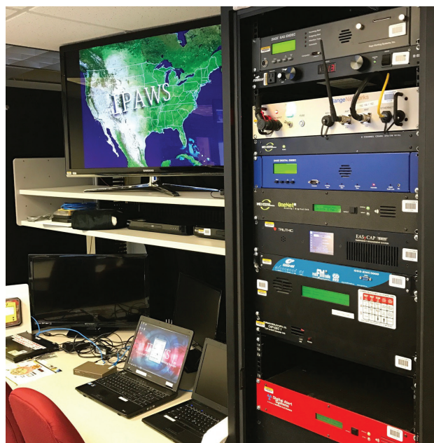
FEMA’s IPAWS national emergency alert gateway equipment

IPAWS is operated by FEMA and provides for the integration of Blue Alerts into the national alert and warning infrastructure. It allows alerting authorities to write their own emergency alerts using commercially available, FEMA-approved software applications that comply with common alerting protocols. These alerts are authenticated and delivered simultaneously through multiple communication pathways to reach the public as quickly as possible. Figure 1 on page 4 depicts the architecture of this integrated alert system.